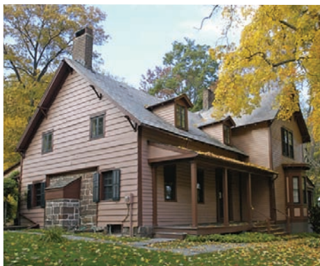
Durand-Hedden House Where History Comes Alive

Sunday, June 14th, 1-4pm 523 Ridgewood Road Maplewood, NJ (973) 763-7712